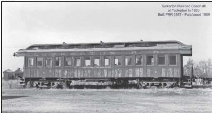
Tuckerton Railroad Coach #6 at Tuckerton in 1933 Built PRR 1887 - Purchased 1889